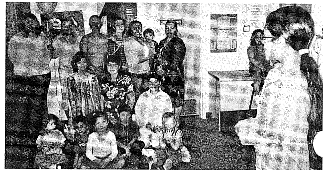
Raising Great Kids class, Cedar Valley Community School.

Lake Stevens Family Center, South Everett Neighborhood Center, Family Support Center of South Snohomish County, and Familias Unidas will jointly sponsor a four-week violence prevention program consisting of instructional family meals, children's activities, culminating in a graduation ceremony. The program is designed to enhance family relationships and increase self-esteem, self-discipline, social competency skills and community involvement of children and parents.