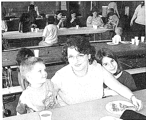
Pizza first, then parenting at Tacoma’s McKinley Elementary School. The program, one of 11 funded by Children’s Trust Foundation’s endowment in 2000, is described in detail on Page 2.

Because the grants to family centers depend on investment earnings, downward market trends, as experienced in the past year, negatively impact our capacity to support local prevention efforts. Without the Burns McCabe challenge grant, CTF’s available grant funds for 2002 would be severely curtailed. Without funding from CTF, many family center programs would end and important resources for strengthening families would be lost.