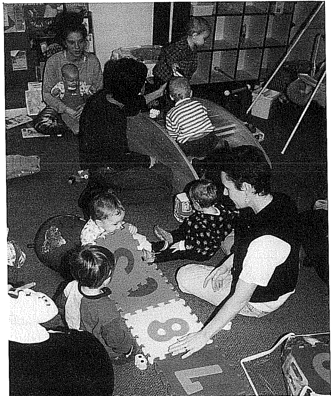
Parents and kids enjoy the Children's Room at Seattle's FamilyWorks, furnished by Children's Trust Foundation as part of the 1997-98 Family Center Initiative. In 1998-99 CTF will furnish a childcare room in Clark County.

Funding from Children's Trust will enable the First Step Family Support Center to reinstate their environmentally enriched preschool program for 2 and 3 year